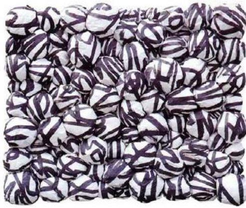
Fig. 8. Wang Nanming, Combination: Ball of Characters, ink on paper, 120 cm x 100 cm, 1992, Pusan Metropolitan Art Museum, South Korea