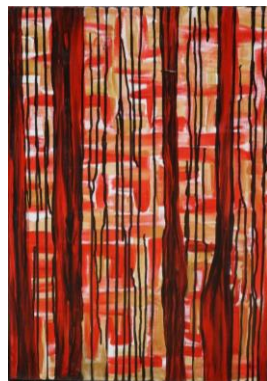
Fig. 11. Daniela Grubisic, Squares Expression II, 2024, Shanghai Art Collection Museum

Today globalism delete border in art. As such, it reflects the complex issues that shape our diverse, globally and rapidly evolving world. We can say that contemporary art today in China has three ways of artistic creation as technology, nature and philosophy way