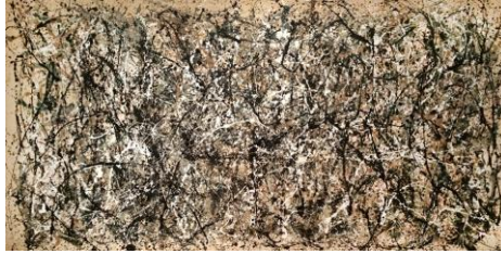
Figure 4. Jackson Pollock, One: Number 31 , Oil Paint, 2,7 m x 5,31 m, 1950, MOMA, New York, US

manifestations of collective unconsciousness. Create calligraphic in artworks of this artists is the most common way for connect action painting with China calligraphic painting. One: Number 31 (Fig. 4.), 1950 is one of the famous and largest Jackson Pollock Abstract Expressionist paintings.