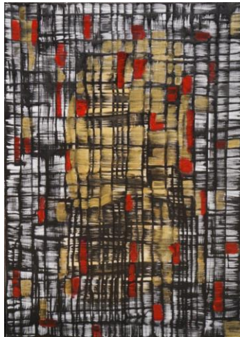
Fig. 10. Daniela Grubisic, Squares Expression I, 2024, Shanghai Art Collection Museum