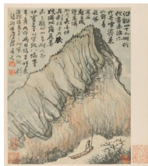
Figure 2. Shitao, Reminiscences of Qinhuai River, Ink and wash painting, landscape, 1642-1707, Cleveland Museum of Art, US

Shitao painting Reminiscences of Qinhuai River 1642-1707 (Fig. 2.), deals with man's place in nature. This painting represents a mountain bowing down and the rocky peak in the image is distorted and defiance of simplicity. The painting represents the respect between man and nature, which is explored in a style reminiscent of surrealism or magical realism. In this painting by the re-presenting, Shitao expresses his respect and attitude towards nature. In this painting we can also see abstract form in the nature of the mountain.