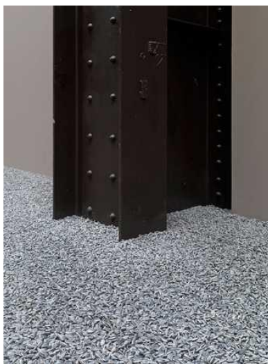
Fig. 9. Ai Weiwei , Sunflower Seeds , 2010, Turbine Hall at Tate Modern