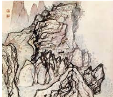
Figure 3. Shitao, Album of Landscape for Elder Yu (leaf 2) , Ink and color on paper, landscape 1641-1708, Metropolitan Museum of Art, New York, US

Album of Landscape for Elder Yu (leaf 2) (Fig. 3.), is very good example of early abstract art. Chinese painting and calligraphy is based on splashing ink and outlining lines. Abstract elements in Chinese freehand painting, are the unique abstract art language of China from 16 century until today. This specific technique and painting language China artists access to the depths of metaphysical consciousness and reaching the extreme of human intuition.