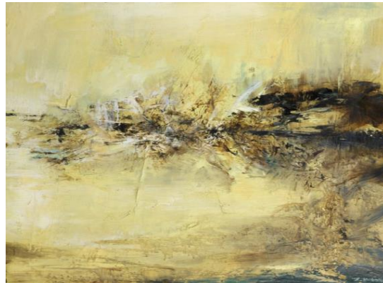
Figure 6. Zao Wou-Ki, oil on canvas, 59,5 x 81 cm, 1967, Collection Henry Clay Frick II, New York, US (sold for €1,392,500 on 5 June 2019 in Paris)

Master artist Wou-Ki Zao (Zao Wou-Ki) a Chinese French painter who was one of the very first to make the link between eastern and western art. He was inspired by nature, something that we cannot see but something what exist like universe as in abstract expressionism. In painting Stunning Work of nature (Fig. 5) he is using powerful brushstroke and calligraphy to present strong emotions in nature. The range of his techniques (Fig. 6.) is from the vigorous, gestured brushstrokes of America's abstract expressionists to the delicate swirls of Chinese ink paintings. He said that "Everybody is bound by tradition. I am bound by two." Zao Wou-ki is a truly "global" artist, and his appeal stems from globalism thinking.