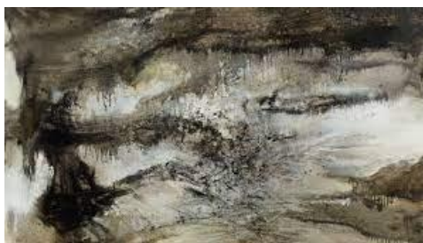
Figure 5. Zao Wou Ki, Stunning Work of nature , brushstroke and calligraphy, 1957, Paris, France