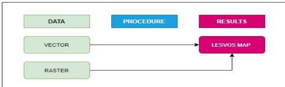
Figure 2. Methodology diagram of Lesvos' map.

Observations made on this map led to further improvements to the map of the island of Lesvos (e.g. the size of the legend), then we made test printouts and the final printing (Map 2).