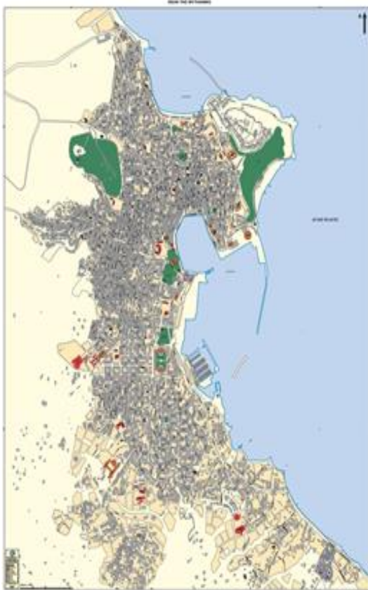
Map 1. Map of the City of Mytilene

The data of the maps were updated, the colours were chosen and the design was completed in previous phase, test prints and corrections were made and then the final map of the city of Mytilene was printed in this phase (Map1, Figure 1).