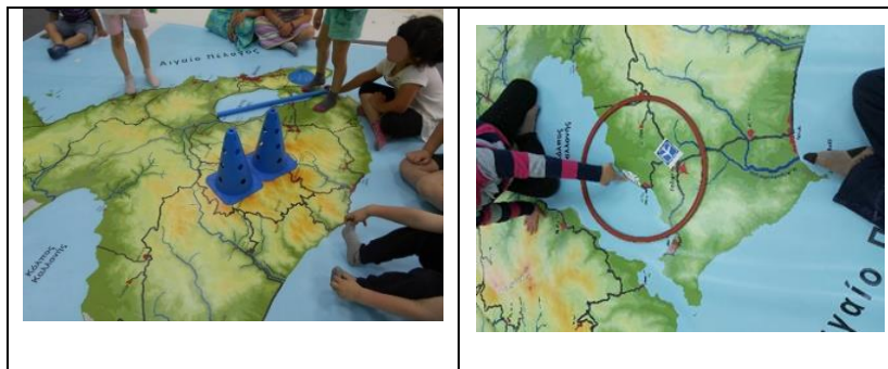
Figure 3. Photos of children in hands-on activities on Lesvos' map.

The pilot session was very interesting and engaging for the children, and some of their photos are presenting in Figure 3.