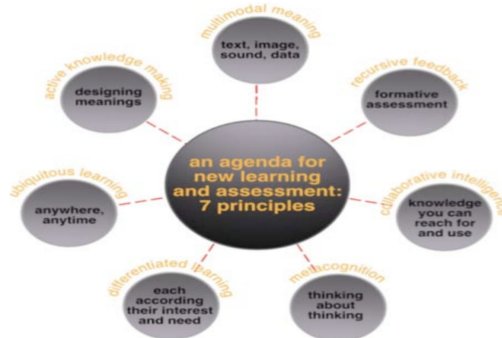
Figure 1: e-Learning Affordances [3]

As e-learning evolved and gained popularity, web technologies evolved at even a faster rate pushing the boundaries and expanding the possibilities for e-learning to offer additional functionalities and richer capabilities. Such evolutions in web technologies and e-learning systems enabled additional affordances as Kalantzis and Cope[3] copiously explain as they present their seven principles, shown in Figure 1, whereby these new e-learning affordances have been instrumental in transforming and shifting the pedagogical paradigm from didactic to reflexive.