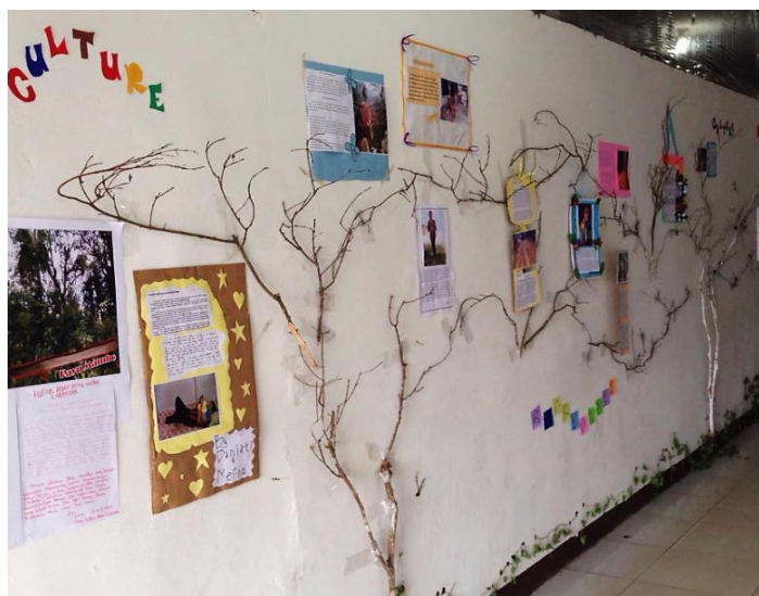
Figure 2. The Exhibition of Cultural Snapshot

In this course, the students learn the concept of cultural material and social phenomenon such as prejudice, discrimination, plurality and others. Besides receiving theoretical information about