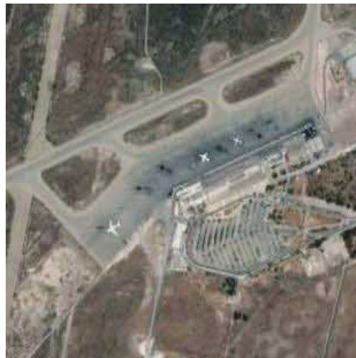
Figure 6. Reconstructed Satellite image (2)