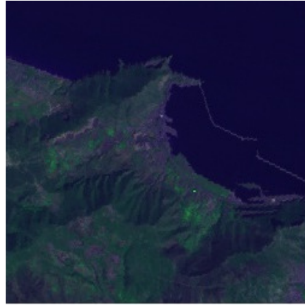
Figure 1. Original Satellite image (1)

The algorithm realized in Builder C++ to code and to decode the satellite image, but all these Images are resized into a resolution of 256 X 256.