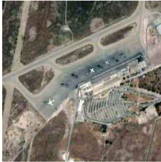
Figure 5. Original Satellite image (2)