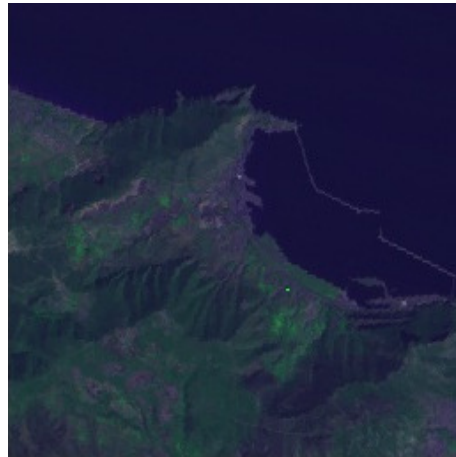
Figure 2. Reconstructed Satellite image (1)