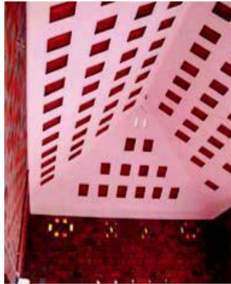
Fig. 2 Filler (Roof) Slab

People look for attractive houses, more environmental friendly and cheaper but also want more life span and to have roofs over larger space areas (e.g. Halls in houses). Using cost-effective technology not only saves money but also reduce CO 2 emissions. When filler slab can be used as an alternative to conventional slab, the cost of construction can reduce up to 25% (Srivastava & Kumar, 2018). The basic principle in a filler slab is that the concrete in the bottom half of the RCC slab is simply considered dead weight and does not take up any compressive loads, but the RCC slab takes up such load. Thus filler in the redundant concrete in tension zone of the slab can be replaced by a suitable lightweight filler material (Sinha, Mishra, Kumar & Saurabh, 2020). Filler slab consists of light weight modest material such as poor quality Mangalore tiles, blocks, coconut shells, glass bottles and so forth. These materials are laid in the steel reinforcement framework (bars of 6mm or 8mm dia.) and cementing is done over them. The Mangalore tiles of size of 23cm x 40 cm and the network size of 33cm x50 cm can be used in the section thickness of 10cm. In specific, RCC filler space of 1:1.5:3 utilizing 20mm broken stone and poor quality Mangalore tiles as filler materials are used.