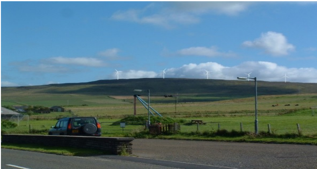
Figure 2: Hammars Hill Wind Farm viewed from Evie School (Orkney Sustainable Energy Ltd., 2017)

To develop wind farms for electricity production in Orkney (see an example of wind farm in Orkney in Figure 2), some necessary documents are studied. Based on Scottish National Heritage (SNH) guidance for strategic planning of wind farms (“Landscape Assessment for Potential Strategic Wind Energy Development in Orkney,” n.d.), it is recommended that the landscape capacity for wind energy should be assessed on the basis that a degree of change to landscape character should be accepted. In general, landscape and visual resources should not be affected, and some of the more sensitive landscapes should be protected from wind energy development (“Landscape Assessment for Potential Strategic Wind Energy Development in Orkney,” n.d.).