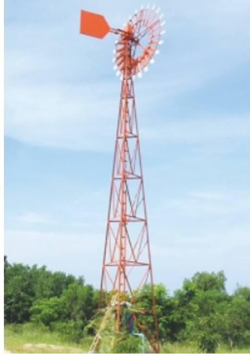
Figure 1: The component of wind turbines to pump water for agricultural purpose (DEDE (Department of Alternative Energy Development and Efficiency), 2018)

However, producing energy from wind using wind machines can cause some negative effects on environment such as on wild bird populations and the visual impact on the landscape (Office of Energy efficiency & Renewable Energy, 2018). Wind turbines may also cause noise and aesthetic pollution (An-Najah National University, 2018).