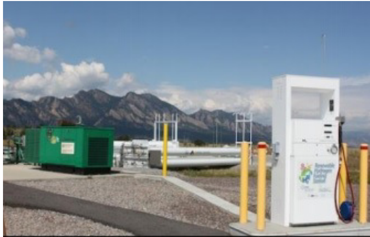
Figure 5: Wind-to-hydrogen facility at NREL (Gasteiger & Markovic, 2003)