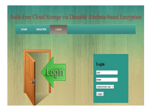
Fig:4.5 Authenticate user login

Fig 4.4 illustrate the process of download the file if the user needs to access the file.