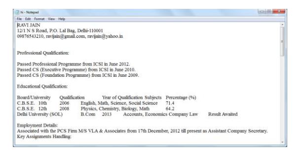
Fig:4.8 Downloaded file

Fig4.7 illustrate the process of downloading the file of the user.